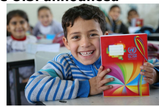
U.S. funded UNRWA educational materials: a partnership for peace.

to severe cutbacks in services and local staffing. Later, the U.S. announced further cuts of $200 million in USAID assistance to the Palestinian Authority and slashed $25 million earmarked for six East Jerusalem hospitals. Visit the UNRWA website to learn more.