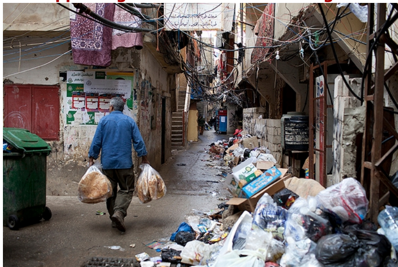
Shatila Refugee Camp, Beirut

Understanding church policy and educating ourselves is a first step in effective activism. B021, a PIN sponsored resolution, was passed at General Convention 2018. It calls on Congress and the Administration to reinstate U.S. funding for UNRWA (U.N. Relief Works Agency) and lift the funding freeze on USAID projects for Palestinians.