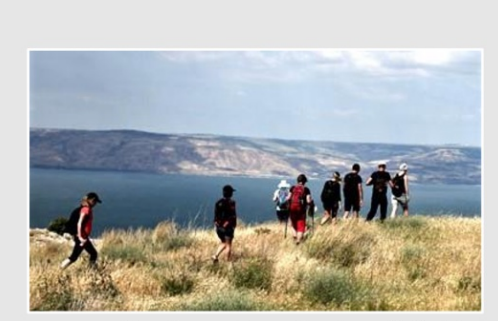
Walking along the Sea of Galilee

Episcopal Peace Fellowship Palestine Israel Network